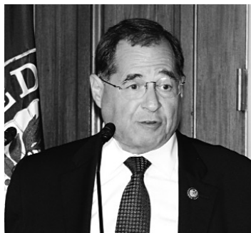
Rep Jerrold Nadler