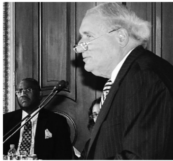
Senator Carl Levin