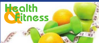
Special FJJ Supplement: pages 44-56