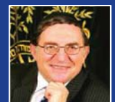
Compassion Priorities: 79