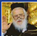
Yartzeits & Tributes: 84