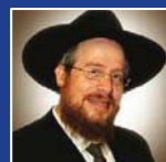
Avrohom Avinu's Ways: 18