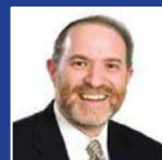
Are You Limping?: 4