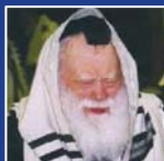
Parshas Vayera: 16