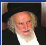
Avodas HaTefilah: 82