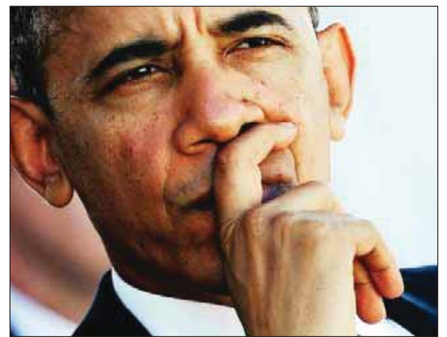
The CNN/ORC poll found that 56 percent of respondents said they did not admire Obama, disagreed with him on important issues and said he does not inspire confidence

Another poll conducted by the Gallup organization put Obama's overall job approval rating at 41 percent, according to the latest weekly findings for Nov. 11-17, down from 45 percent in September, before the healthcare law rollout.