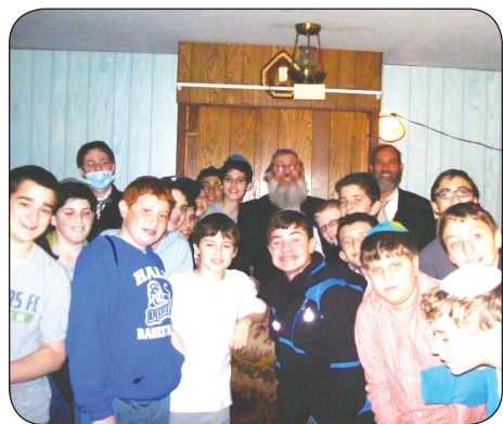
In shul after Minchah .