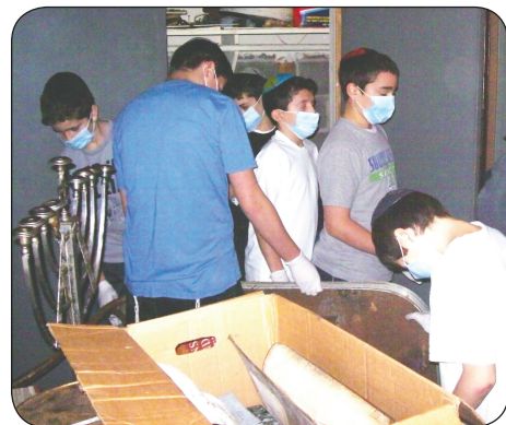
Cleaning the shul .