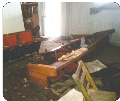
The shul before being cleaned.