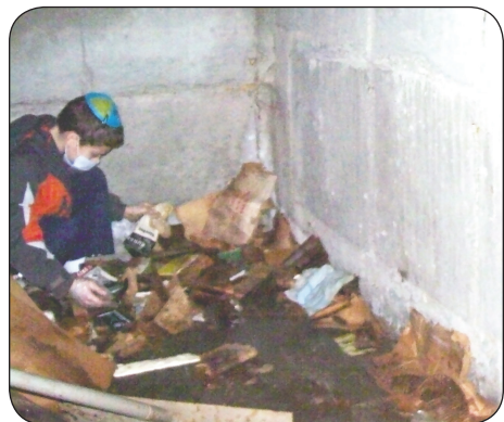
Cleaning the basement.

Borough Park is home to the largest population of Holocaust survivors in the United States, and many local families trace their lineage to individuals saved by Wallenberg.