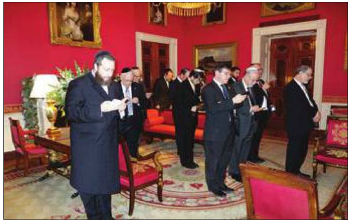
Davening Maariv in the Red Room