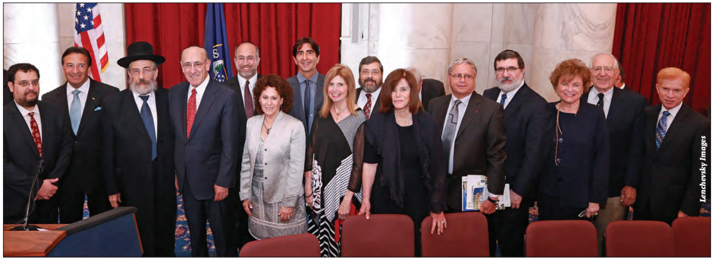
Members of the U.S. Commission for the Preservation of America's Heritage Abroad

Rep. Hoyer noted that efforts to destroy cultural sites are not only attempts to destroy objects, they are attempts to destroy the faiths the sites symbolize. He mentioned that Rabbi Zvi Kestenbaum, a Holocaust survivor, was greatly pained by the destruction