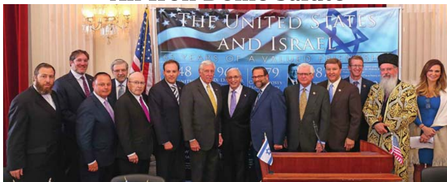
A delegation of American Jews and other dignitaries went to Congress last week to pay tribute to members of the House of Representatives for their support of Israel's defense and security. See story at right.